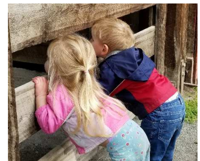
Watching the horses

This spring we were excited when the restrictions here in Alaska were lifted in time for the kids to attend another Homeschool Horsemanship Camp. Safety restrictions for Covid-19 have changed the 'camps' to one-day events instead of the overnights we were doing before. This meant a lot of traveling (2 hours